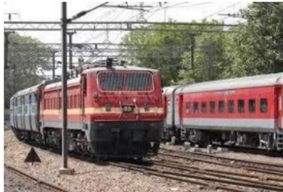
The Indian railway network is the largest in Asia