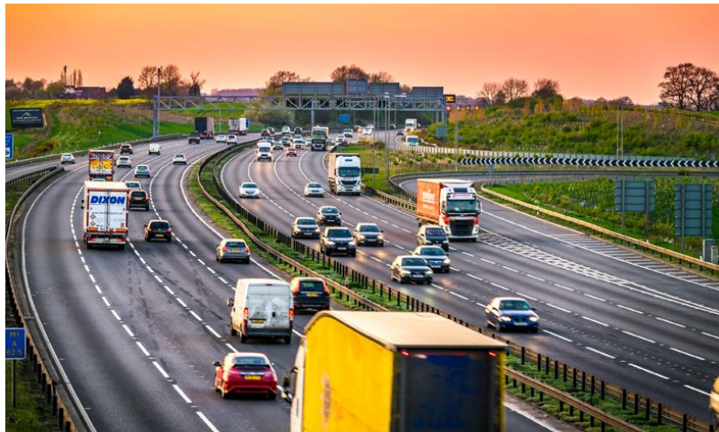
Roads are the most common means of transport