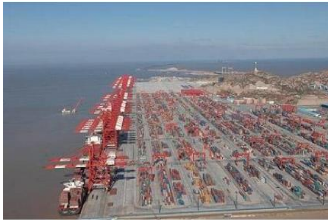
The Shanghai Port in China