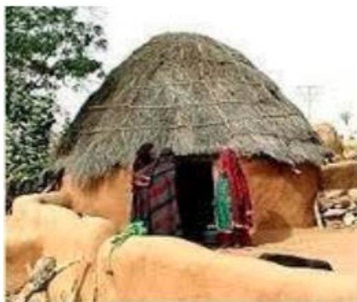
In regions of hot climate, people live in thick mud walled houses with thatched roofs