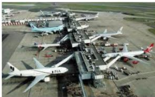
The Heathrow Airport in London, UK